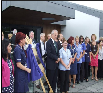
Sir Bruce Keogh, head of NHS England at the official opening of the new hospital in 2014

This included a Health Fair with the League of Friends in attendance.