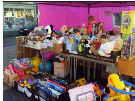
League of Friends Toy Sale, Cockermouth Main Street, 23rd November 2014